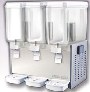
JD 318 JET

Colour Selection: Blue(B), Orange(O), Normal(N), Pink(P), Yellow(Y)