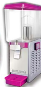
JD 118 MIX