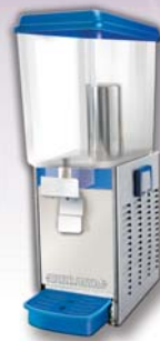
JD 118 JET