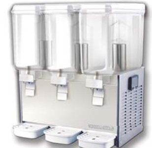
JD 318 MIX

Colour Selection: Blue(B), Orange(O), Normal(N), Pink(P), Yellow(Y)