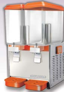
JD 218 JET