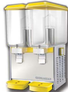
JD 218 MIX