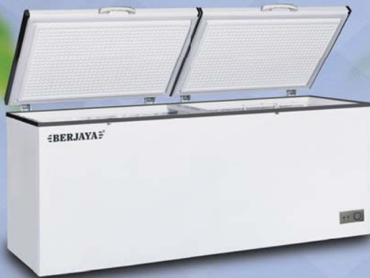
BJY-CFSD500A BJY-CFSD600A BJY-CFSD700A