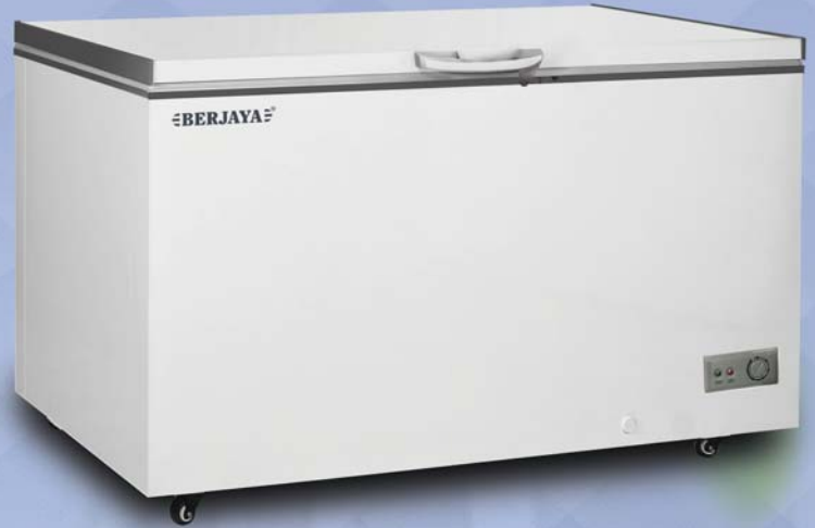
BJY-CFSD200A BJY-CFSD300A BJY-CFSD400A